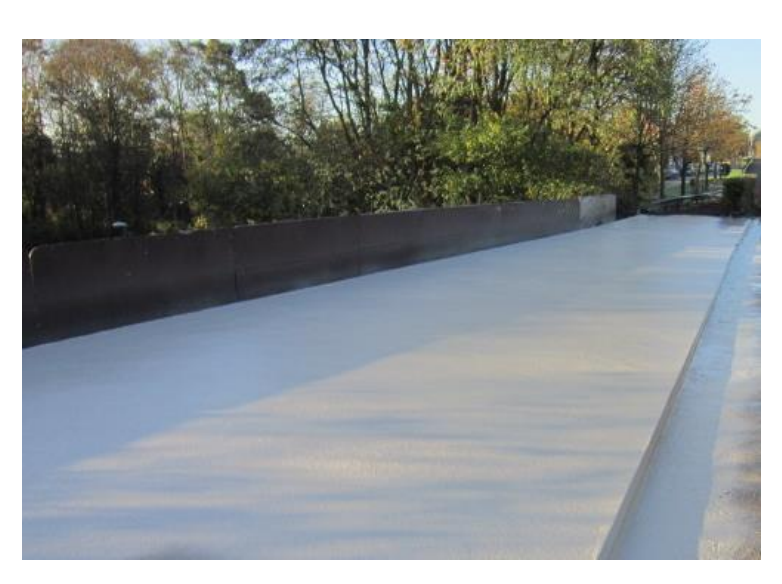
Our reference in Leuven (Belgium): Ring road Leuven: Side walk roads waterproofing