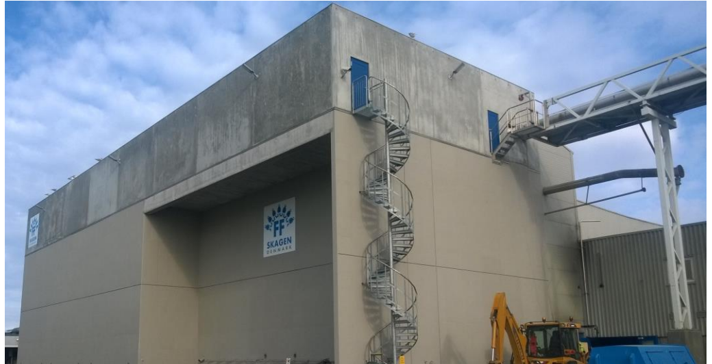
Our reference in Skagen (Denmark): FF Skagen fish meal tanks