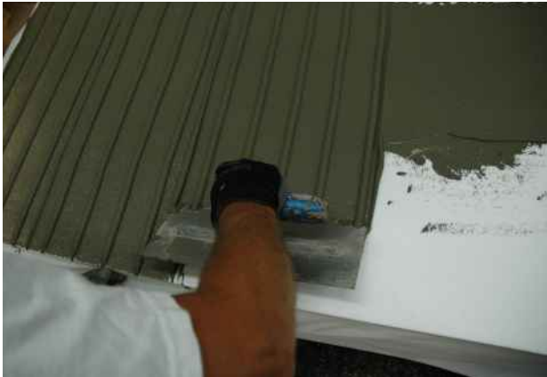
Cementitious adhesive/basecoat properly applied in vertical ribbons to back of EPS board.

The photographs below illustrate the proper method of cementitious adhesive/base coat application to EPS insulation board for Class PB Drainable EIFS as well as an appropriate representation of EPS insulation board which has been “spot checked” for adhesion to the substrate.