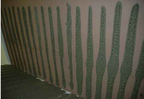
Typical example of troweled adhesive transferred to the substrate, creating channels for drainage.

For the most current version of this literature, please visit our website at www.master-builders-solutions.com/en-us .