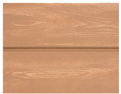
Bottom Coat: 32-M Light Peach Top Coat: 125-U Light Brick Red