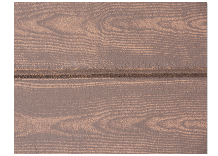
Bottom Coat: 125-U Light Brick Red Top Coat: 215-N Old Earth