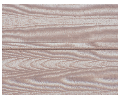
Bottom Coat: 267-P Special White Top Coat: 199-M Woodland Blush