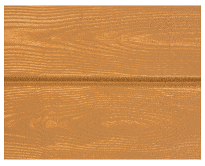
Bottom Coat: 28-M Mellow Pine Top Coat: 34-N Almond Tan