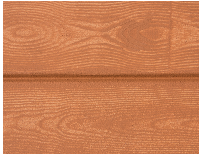
Bottom Coat: 141-M Ultrasuede Top Coat: 142-U Red Brown