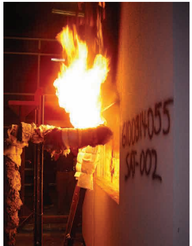
Senergy Wall Systems are detailed in accordance with prevailing code requirements

// Design professionals who specify Senergy CI Wall Systems installed per Master Builders Solutions instructions are specifying code compliant systems."