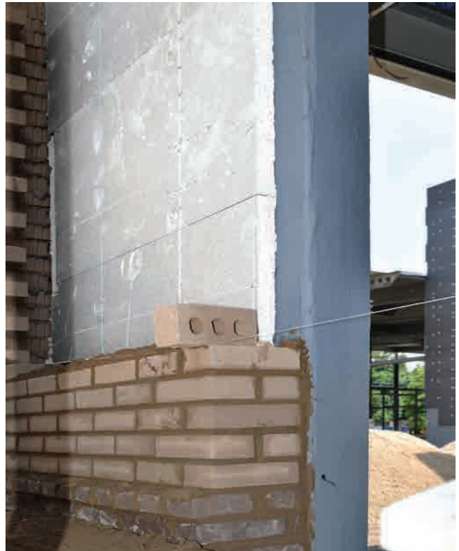
Senershield air/water-resistive barriers can provide a continuous air and water-resistive barrier behind multiple claddings for uninterrupted air and moisture protection

Some fire requirements, such as the ASTM E84 Steiner Tunnel test, apply to specific materials. Others, such as NFPA 285, are assembly tests where the assembly itself must be evaluated.