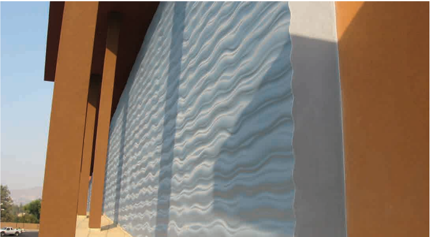
Senergy Channeled Adhesive CI Design, incorporating Master Builders Solutions Metallic Effects, can produce an energy efficient building with endless design possibilities.