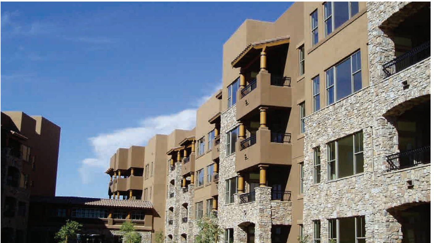
Senershield air/water-resistive barriers can provide seamless monolithic protection on buildings with multiple claddings