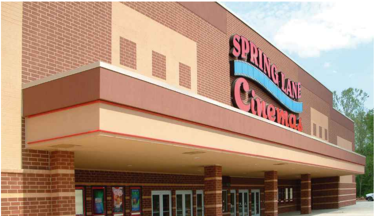
Faux Brick allows you to achieve the appearance you want, using one trade and in less time