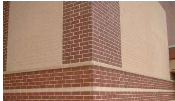
Variations in the brick's color and positioning create endless design options