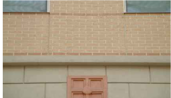
The block, accent medallion and running bond appearance (with darker stretcher bond accent rows), are all done in EIFS