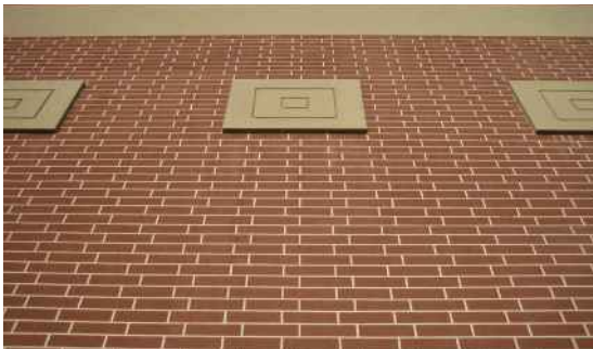
A raking stretcher bond appearance with finished foam shapes to accentuate the wall