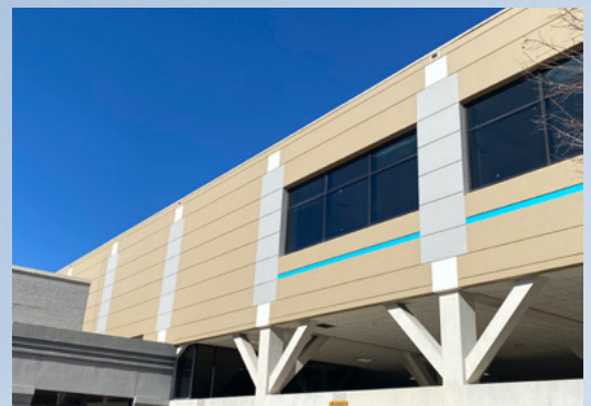
Riverfront Building before and after restoration