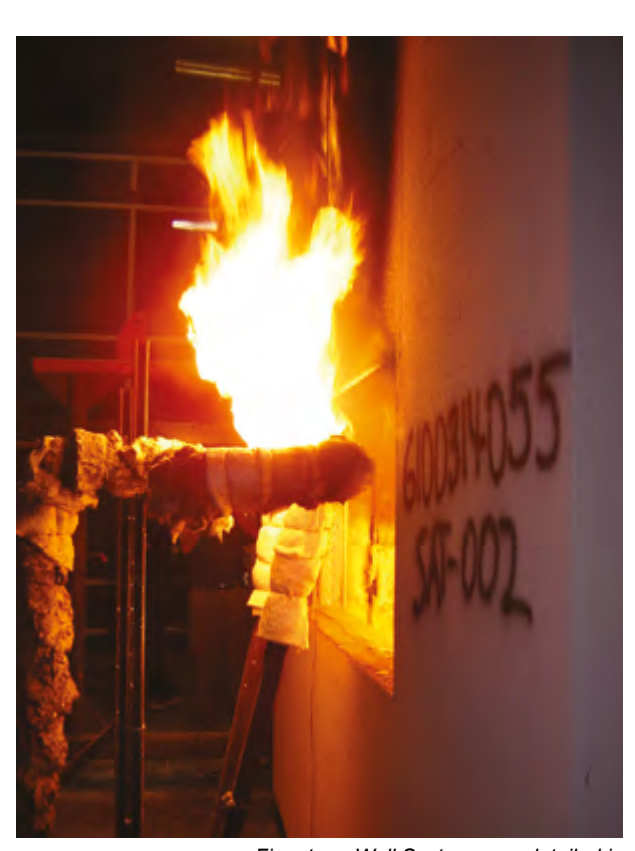
Finestone Wall Systems are detailed in accordance with prevailing code requirements

Failure to correctly detail rough openings will result in wall assemblies that do not comply with NFPA 285 requirements.