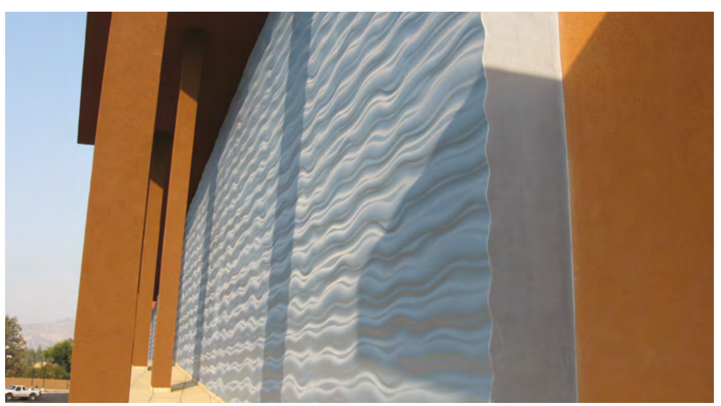
Finestone Pebbletex CI-DCA, incorporating Master Builders Solutions Metallic Effects, can produce an energy efficient building with endless design possibilities.