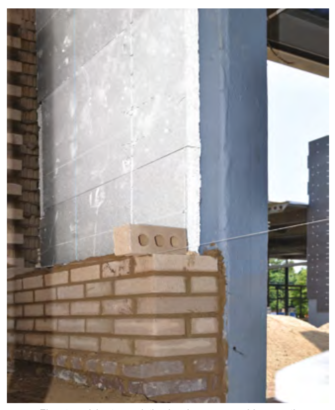
Finestop air/water-resistive barriers can provide a continuous air and water-resistive barrier behind multiple claddings for uninterrupted air and moisture protection

Claddings that are comprised of materials from more than one manufacturer require careful consideration.