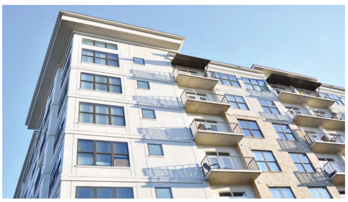
Finestone Wall Systems can create a multiple cladding appearance with continuous exterior insulation and a seamless air/water-resistive barrier