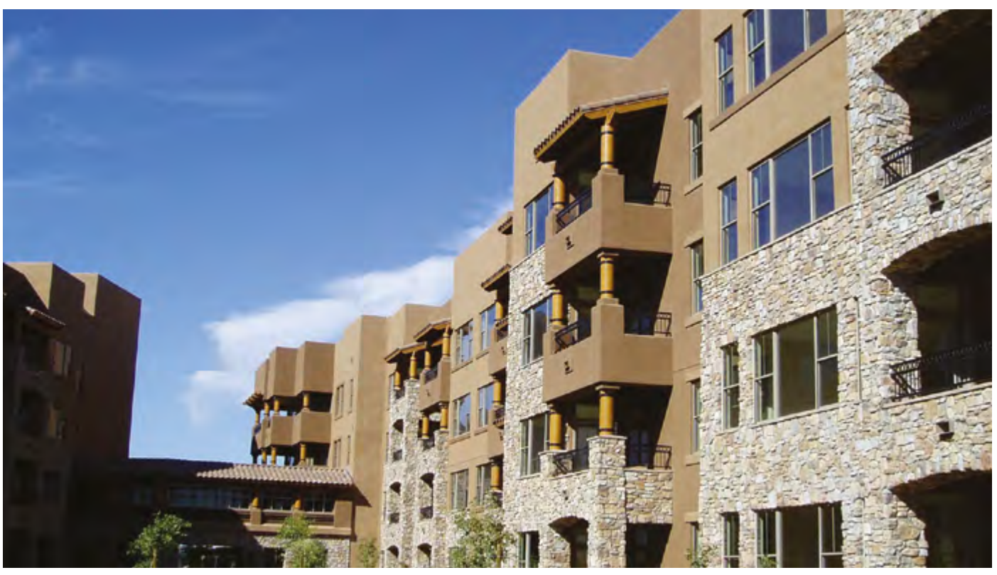
Finestop air/water-resistive barriers can provide seamless monolithic protection on buildings with multiple claddings