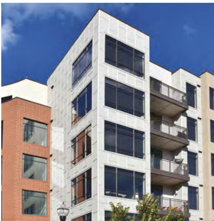
Finestone specialty finishes are available in brick, stone, metal, and stucco motifs. Dynamic aesthetics combined with continuous exterior insulation and a monolithic air/water-resistive barrier create impressive lightweight, high-performance building enclosures.