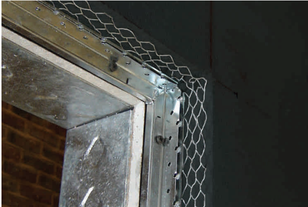
Typical CI Insulation