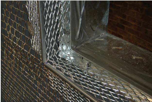
Typical Opening/Return after Trim Accessory and Plaster Base Application