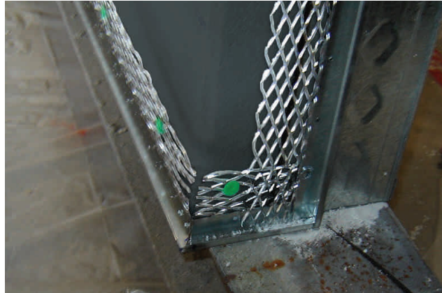
Typical Return at Opening