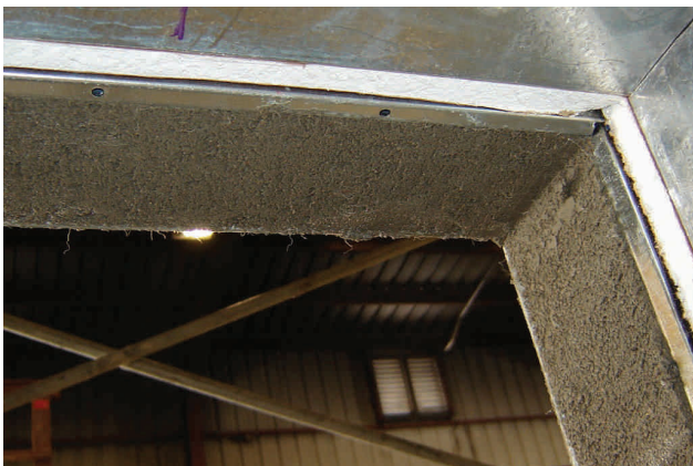
Typical Opening/Return after Stucco Application

For the most current version of this literature, please visit our website at www.master-builders-solutions.com/en-us .