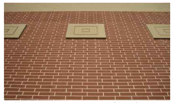
A raking stretcher bond appearance with finished foam shapes to accentuate the wall