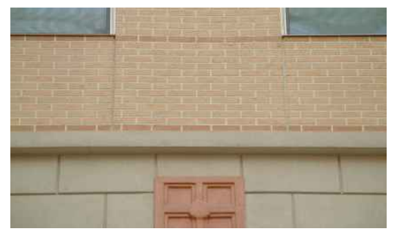
The block, accent medallion and running bond appearance (with darker stretcher bond accent rows), are all done in EIFS