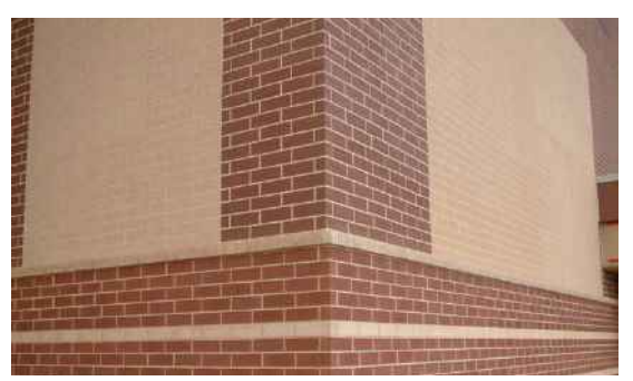
Variations in the brick's color and positioning create endless design options