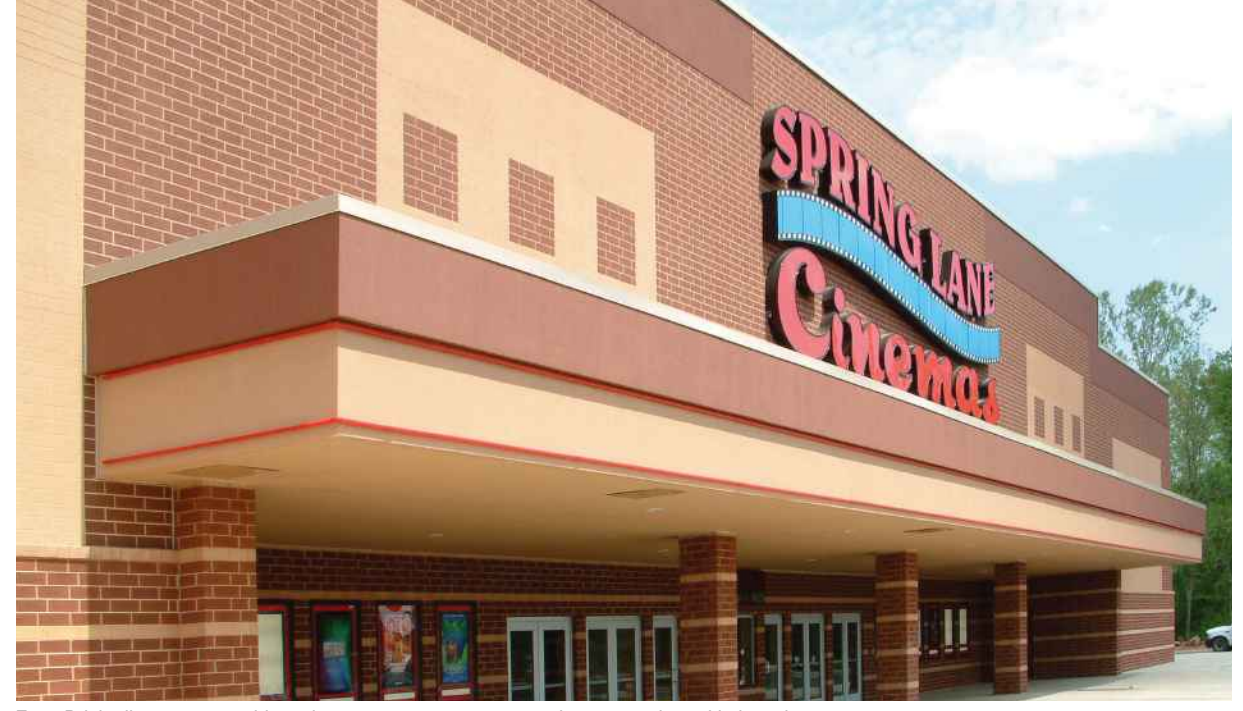
Faux Brick allows you to achieve the appearance you want, using one trade and in less time