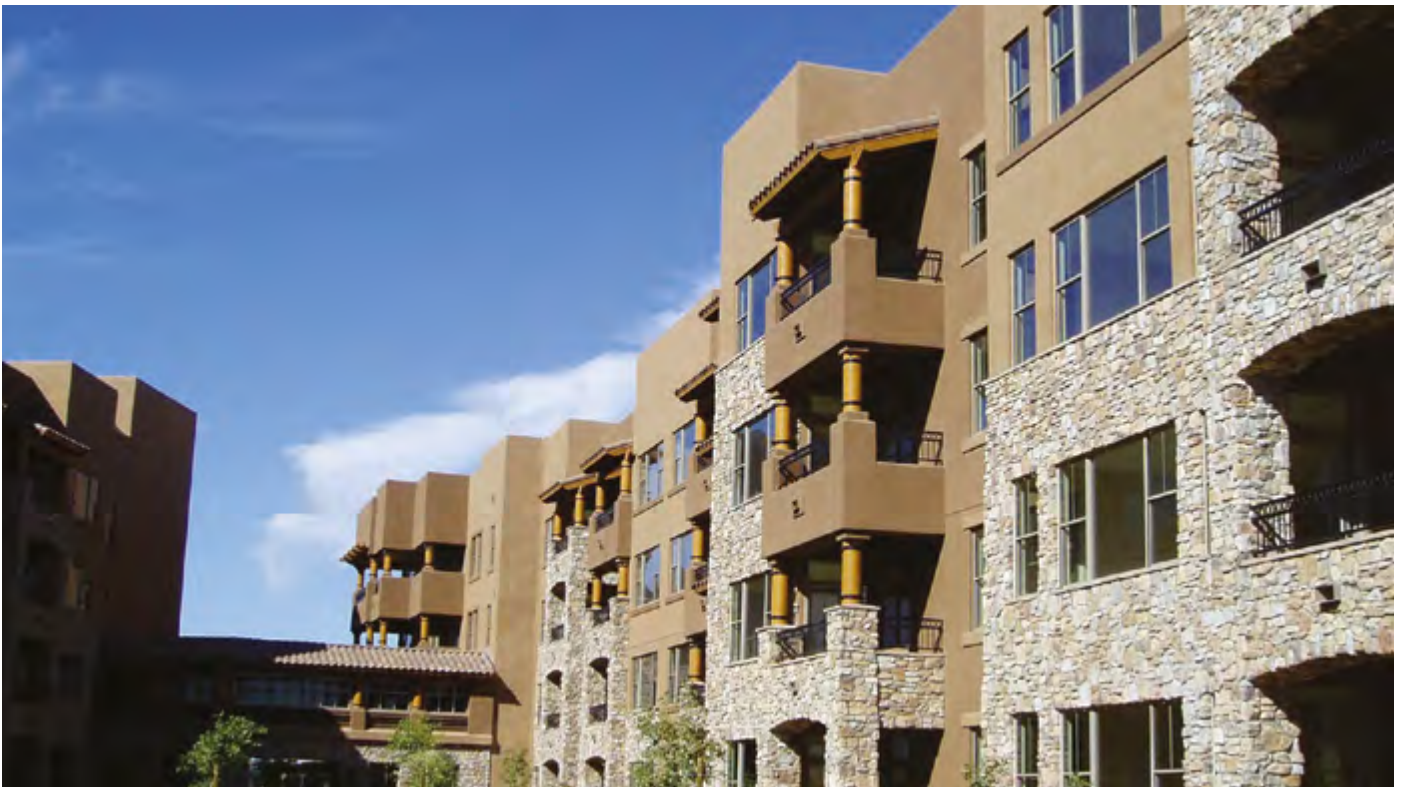
Finestop air/water-resistive barriers can provide seamless monolithic protection on buildings with multiple claddings