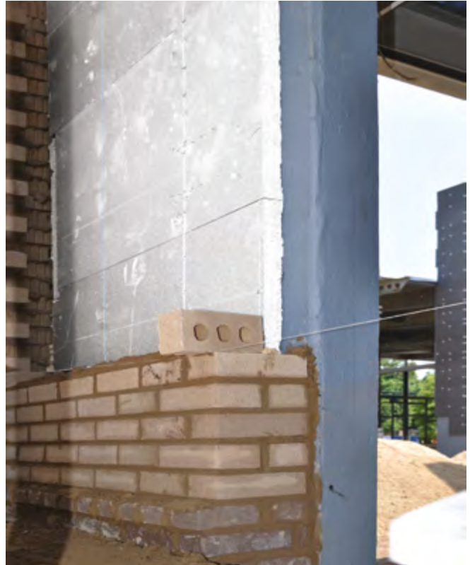
Finestop air/water-resistive barriers can provide a continuous air and water-resistive barrier behind multiple claddings for uninterrupted air and moisture protection

Some fire requirements, such as the ASTM E84 Steiner Tunnel test, apply to specific materials. Others, such as NFPA 285, are assembly tests where the assembly itself must be evaluated.