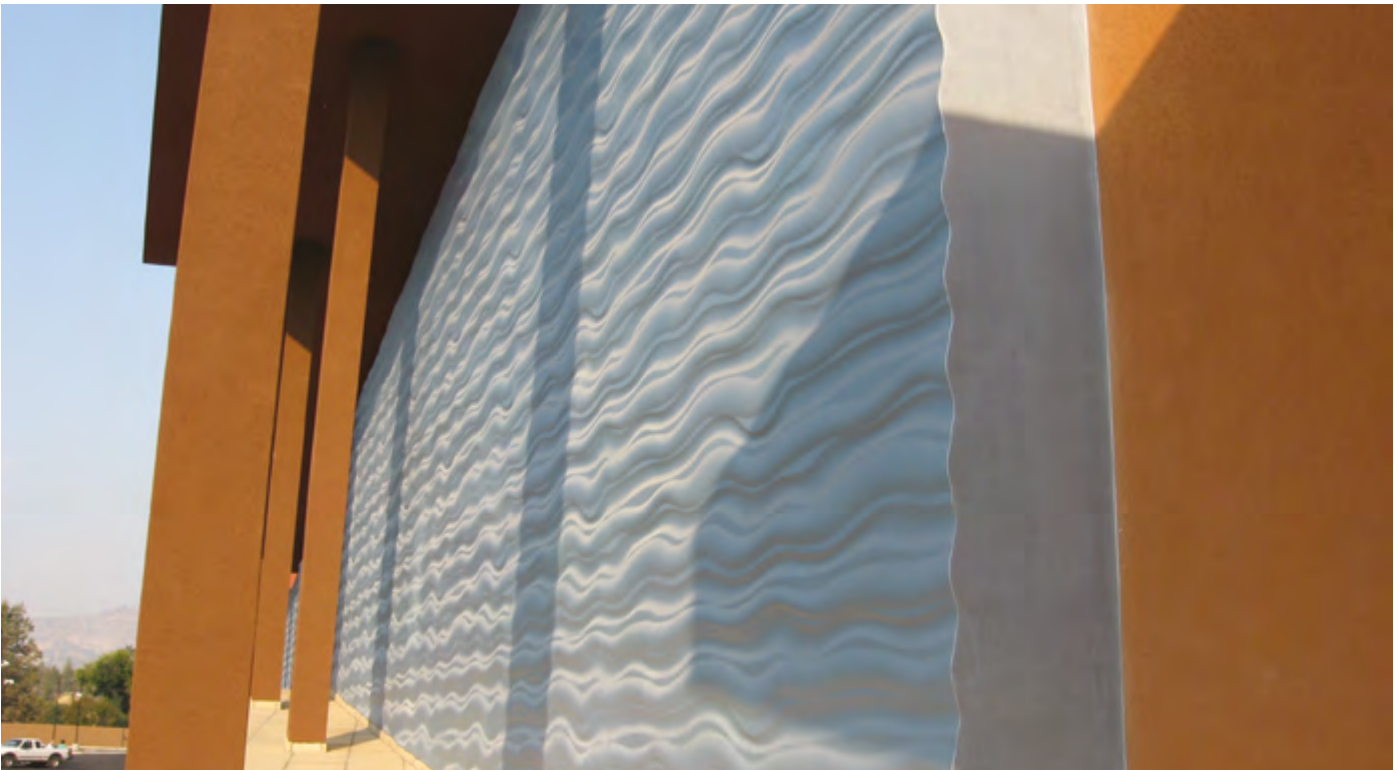
Finestone Pebbletex CI-DCA, incorporating Master Builders Solutions Metallic Effects, can produce an energy efficient building with endless design possibilities.