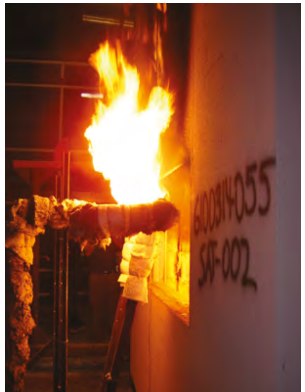
Finestone Wall Systems are detailed in accordance with prevailing code requirements

“ Design professionals who specify Finestone CI Wall Systems installed per Master Builders Solutions instructions are specifying code compliant systems.”