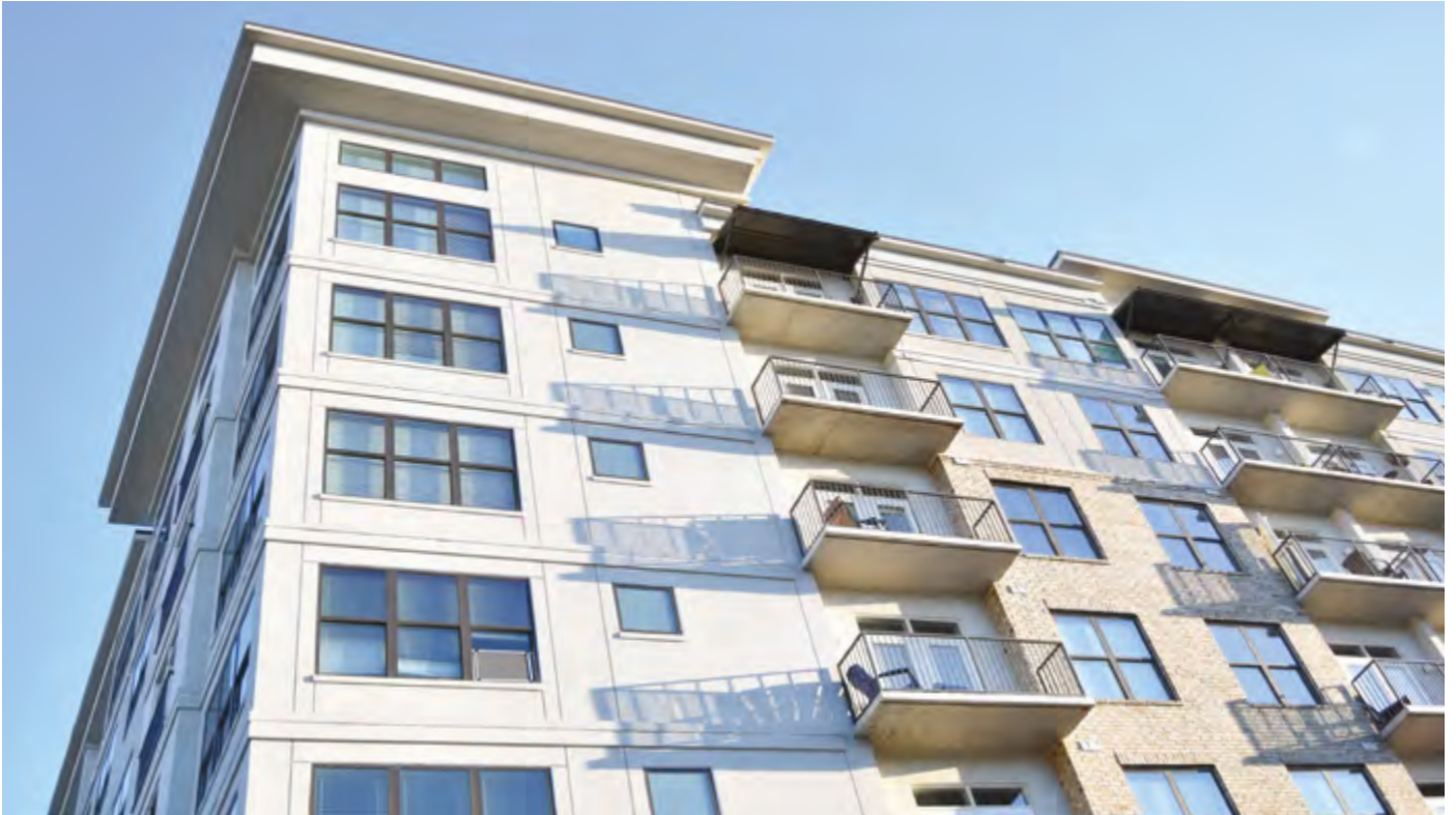
Finestone Wall Systems can create a multiple cladding appearance with continuous exterior insulation and a seamless air/water-resistive barrier