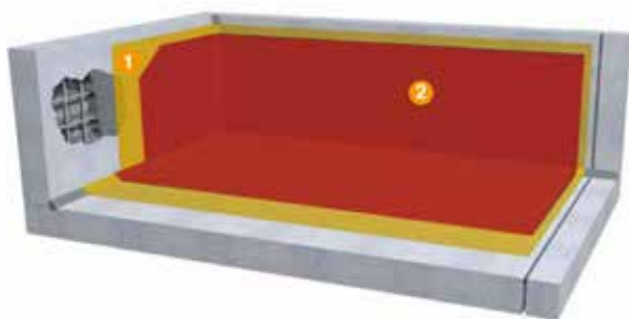
The 2 different colors of MasterSeal 7000 CR, red and Grey low It provides a security application environment even with visibility.

Membrane: MasterSeal® 790 is Xolutec technology based on high chemical and mechanical resistance two-component, with crack bridging feature is the membrane MasterSeal® 7000 CR