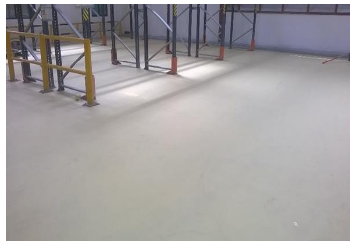
Our reference Lagos (Nigeria): Friesland Campina, Lagos