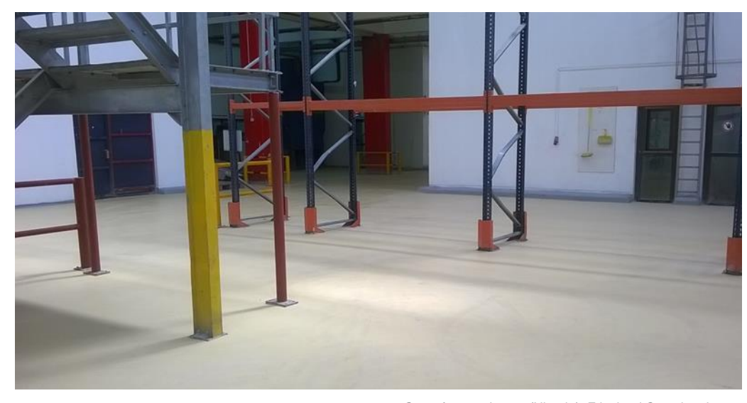
Our reference Lagos (Nigeria): Friesland Campina, Lagos