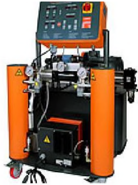
Hydraulic Spraying Machine