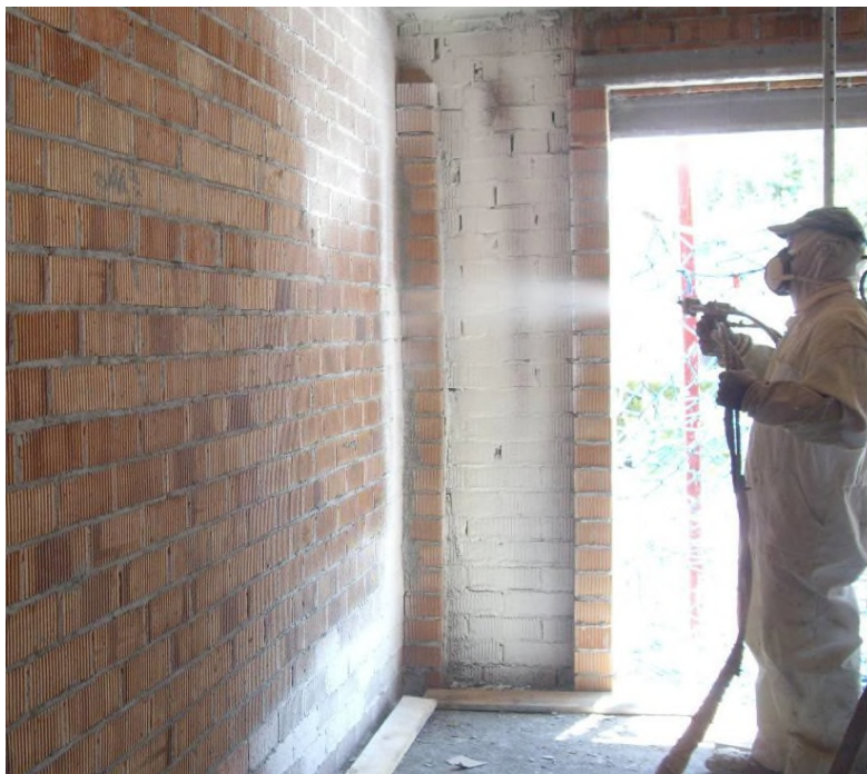
Application of primer layer over a ceramic substrate

It is important to make sure that the product is projected correctly as a liquid when it leaves the spray gun, turning to solid foam as soon as it touched the surface.