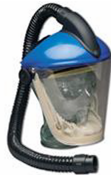
Example of Facial Mask with positive air