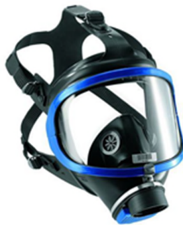
Example of Breathing Filter