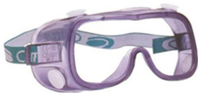
Example of Safety Goggles

When using solvents to clean the machine parts, it is important to pay attention to the manufacturer’s instructions.