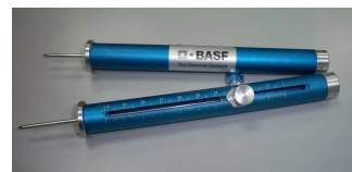
Foam Thickness Gauge

The determination of the foam thickness is done by means of a graduated poker which has a punching diameter of less than 2 mm