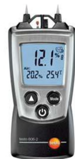
Needle Substrate Moisture Meter

Substrate moisture meters generally have 2 needles that allow the apparatus to determine the humidity up to 3 cm inside the substrate. It is not recommended to use equipment that measures just the surface properties of the material.