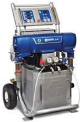
Electric Spraying Machine