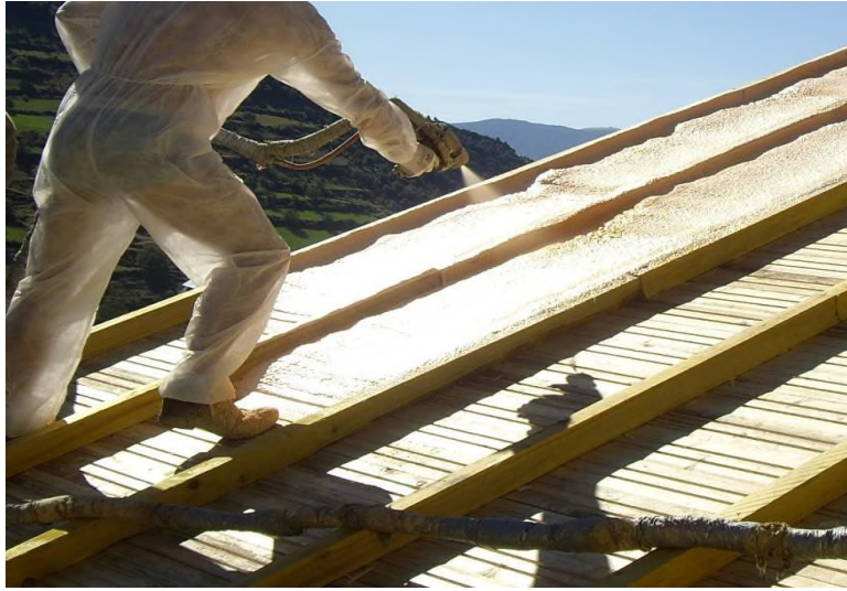
Application of the foam between rafters in a wood roof

The spraying should be done in horizontal or vertical directions checking that there are no points with excessive product accumulation. Spraying should be as perpendicular as possible to the substrate.