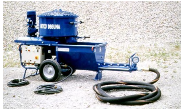
Fig. 1 : MEYCO Deguna Mixer and Pump