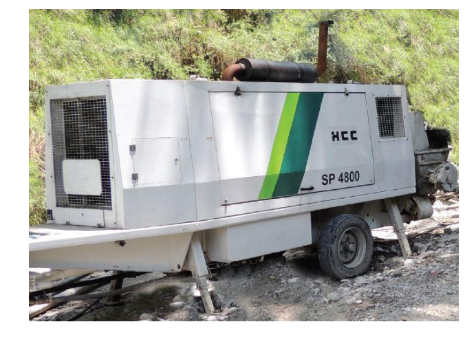
Concrete pump is the heart of the operation. It can be operated on 2 sidespiston side (for Long distance) and rod side (for short distance)