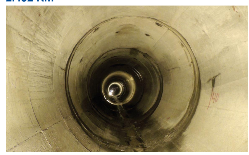
Head Race tunnel of 100 MW Sainj Hydroelectric Power Plant