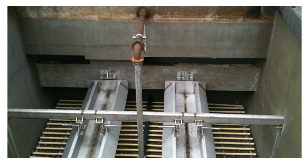
Our reference in West Wales (United Kingdom): Water Treatment Works