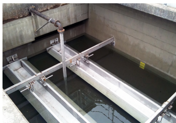
Our reference in West Wales (United Kingdom): Water Treatment Works