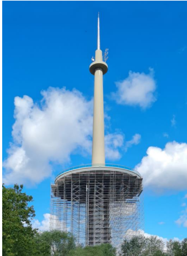
Concrete repair, protection and waterproofing on the highest water tower in the world.

The highest water tower in the world at 143 meters