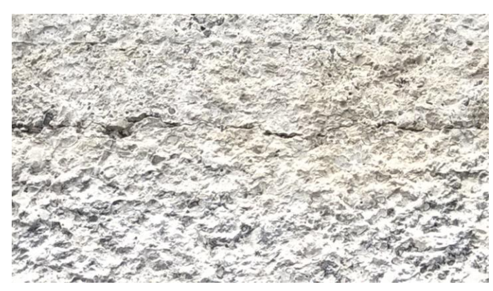
Our reference project in Lustin (Belgium): the Vivaqua-Tailfer sludge treatment building after remediation