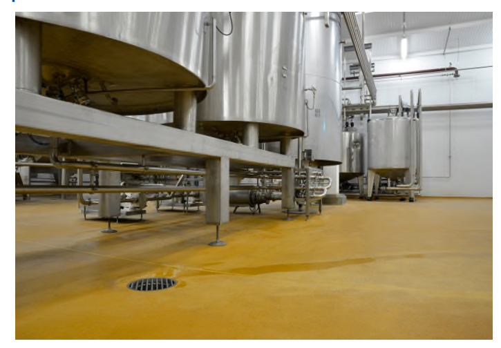
Our reference in Wrexham (United Kingdom): Tomlinson Dairies