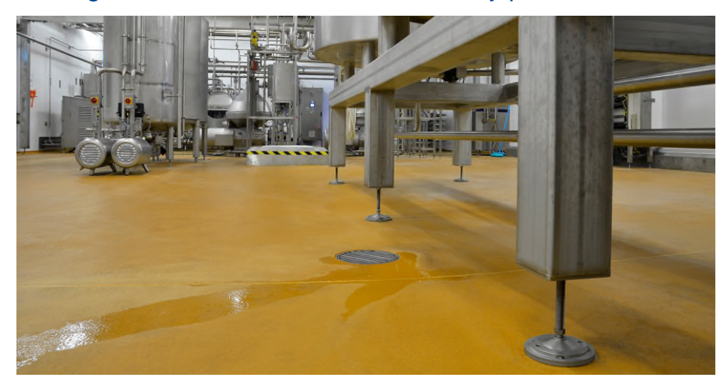
Our reference in Wrexham (United Kingdom): Tomlinson Dairies

Flooring solution for short timescale in dairy production area