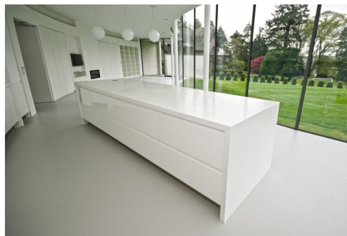
Our reference in Aberdeen, (United Kingdom): The Firs Residential Project