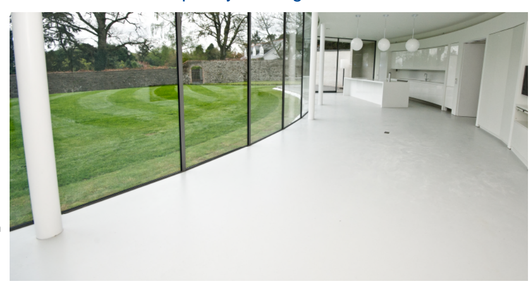
Our reference in Aberdeen (United Kingdom): The Firs Residential Project

Architectural contemporary flooring solution