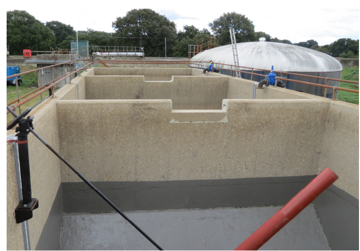
Our reference in Southampton (United Kingdom): Sewage Water Treatment Works