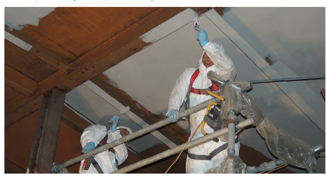
Our reference in East Sussex (United Kingdom): Service Reservoir