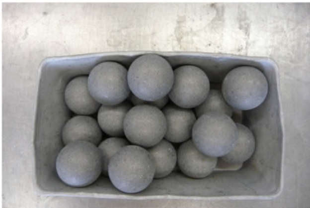
Figure 2. Steel balls used for impact