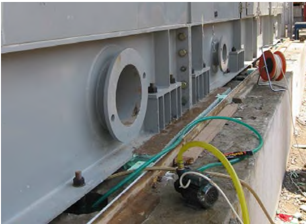
Figure 1. Saturating and draining the excessive water in the anchor holes of the turbine foundation prior to grouting.

Base plates, bolts, etc. must be clean and free of oil, grease and paint etc. Set and align equipment. If shims are to be removed after the grout has set, then lightly grease them for easy removal.