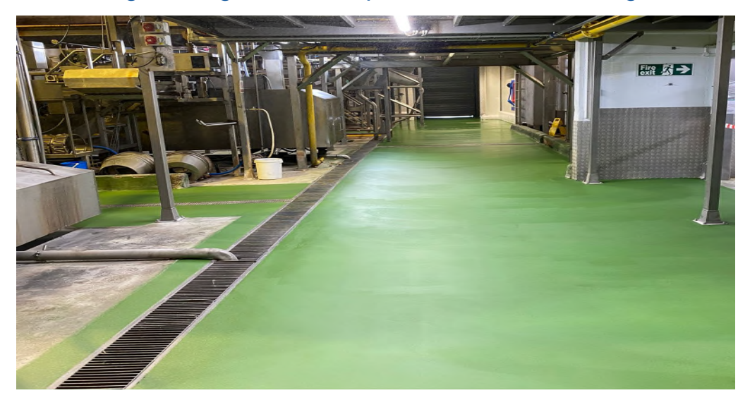
Our reference in London (United Kingdom): Kolak Snack Foods

Fast curing flooring solution in production area limiting downtime