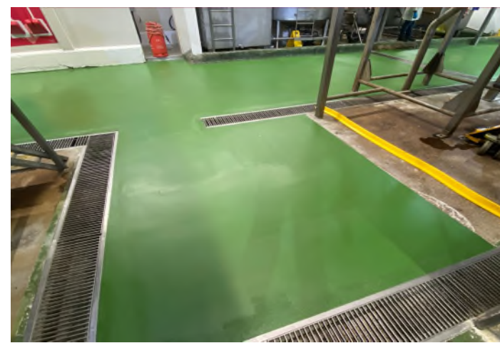
Our reference in London (United Kingdom): Kolak Snack Foods