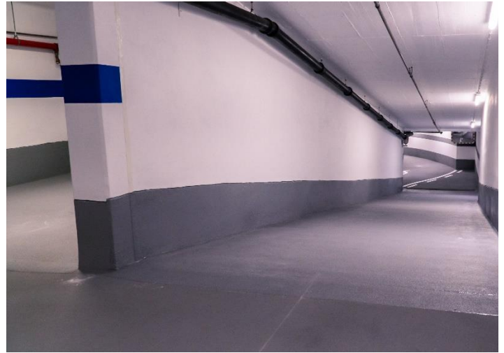
MasterSeal Traffic 2239 was used on the underground decks and MasterSeal Traffic 2219 on the ramps and the inner courtyard