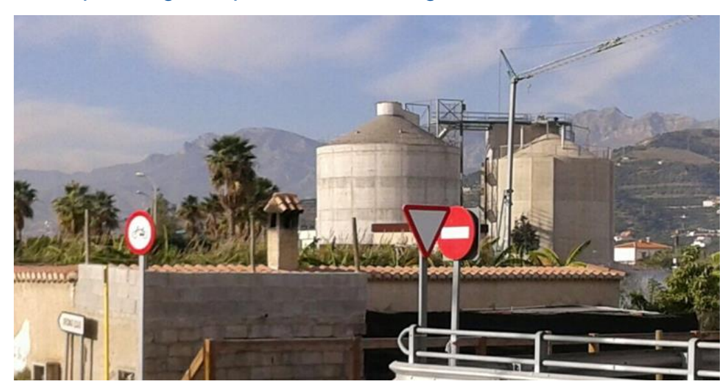
Construction of a second digester

Waterproofing and protection of a digester