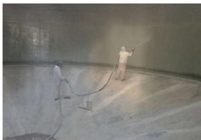
Application of MasterSeal M 689 polyurea waterproofing and protection membrane.