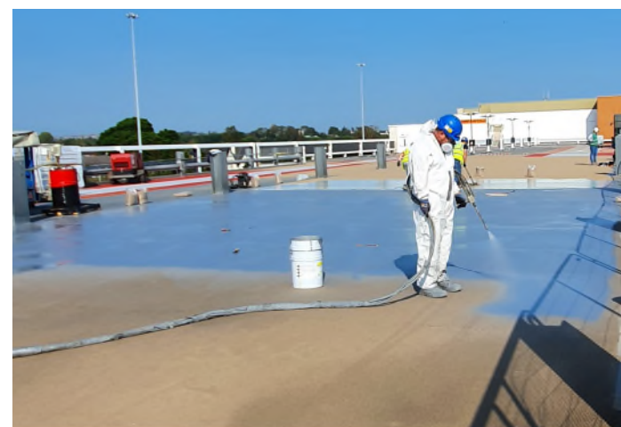
Our reference in Cork (Ireland): Douglas Village Multi-Storey Car Park