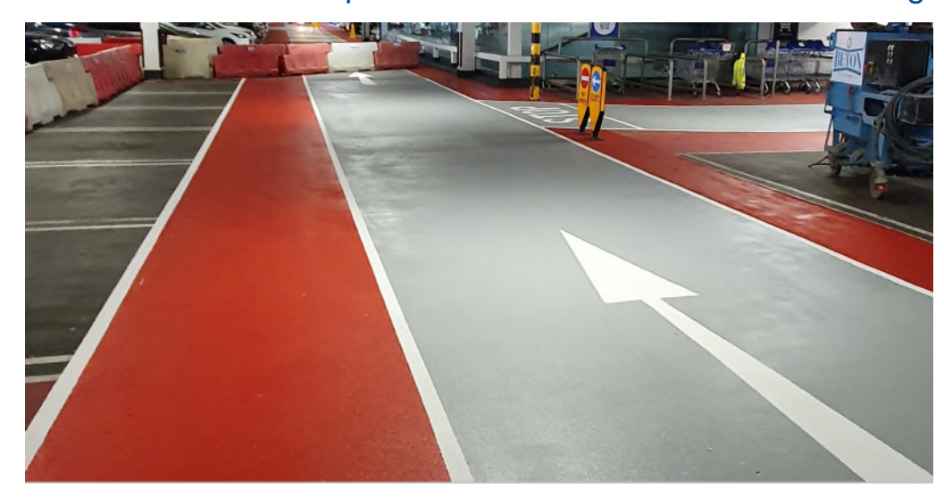
Our reference in Cork (Ireland): Douglas Village Multi-Storey Car Park

Refurbishment of car park after fire caused millions in damage