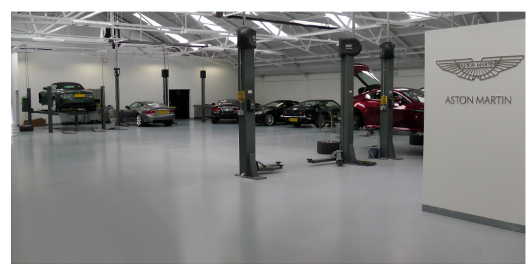
Our reference in Newport Pagnell (United Kingdon): Aston Martin Lagonda

Crack-bridging flooring solution for automotive workshops