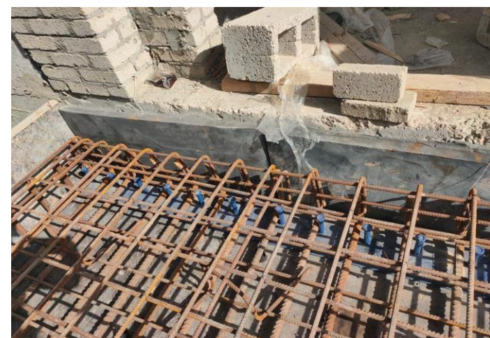
Our reference in New Alamein (Egypt): Old City