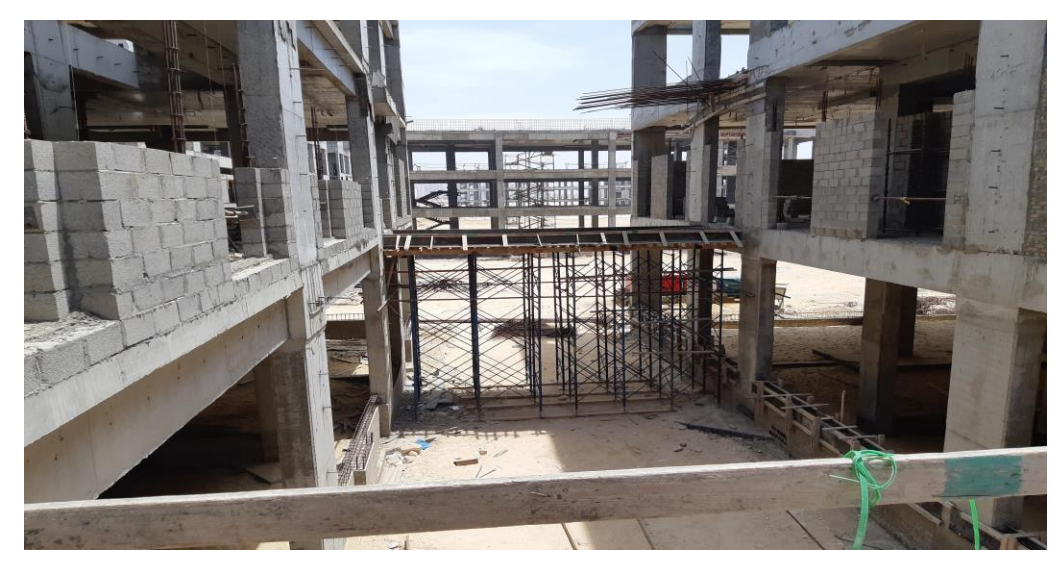
Our reference in New Alamein (Egypt): Old City