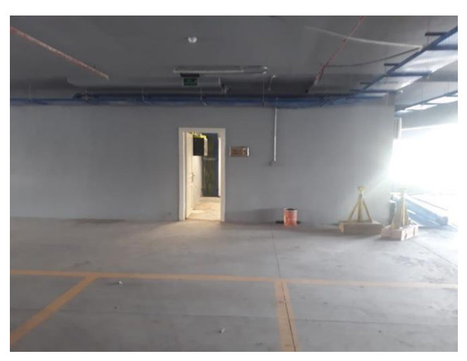
Our reference in Alexandria (Egypt): Garage of Alex' port