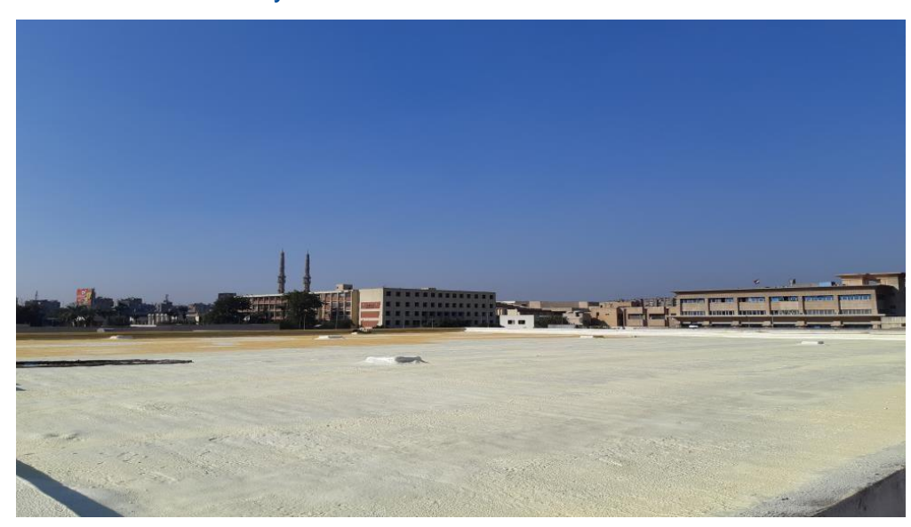
Our reference in Cairo (Egypt): Ain Shams Specialized Hospital