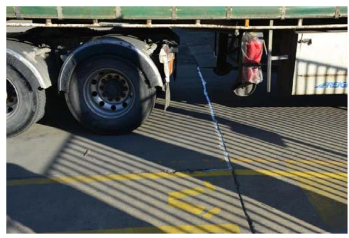
Traffic moved over the joint within 15 minutes of application