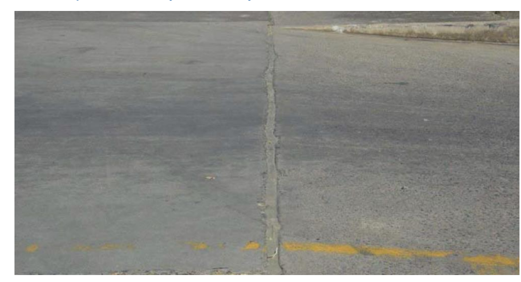
The repaired joint outside MB Solutions Seven Hills warehouse driveway