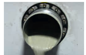
Bolted connection and grout overflow

Master Builders Solutions Product Management c/o PCI Augsburg GmbH Piccardstrasse 11 86159 Augsburg, Germany www.master-builders-solutions.com