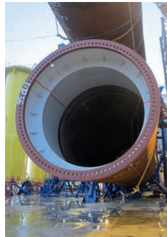
Monopile on deck