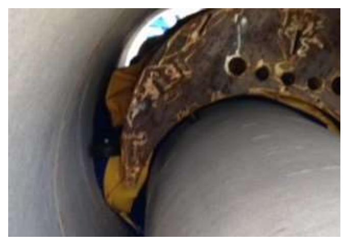
Mock-up inflatable bags before filling with precision grout