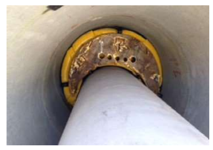
Mock-up of the inflatable bags after filling with precision grout sealing the tunnel annulus