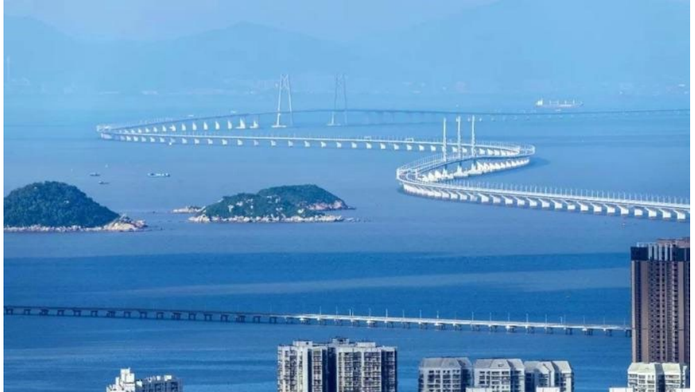
Our reference in China: Hong Kong-Zhuhai-Macau Bridge