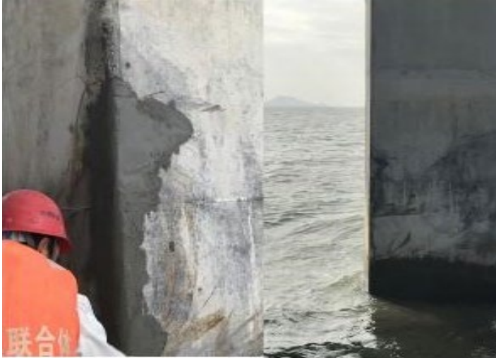
MasterEmaco 1438 application for bridge piers