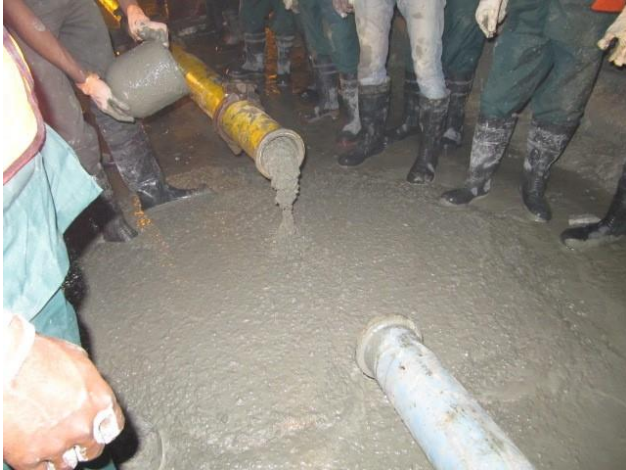
Flow of concrete at 2,400m from the pumping point