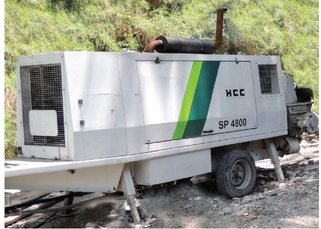
Concrete pump is the heart of the operation. It can be operated on 2 sides - piston side (for Long distance) and rod side (for short distance)