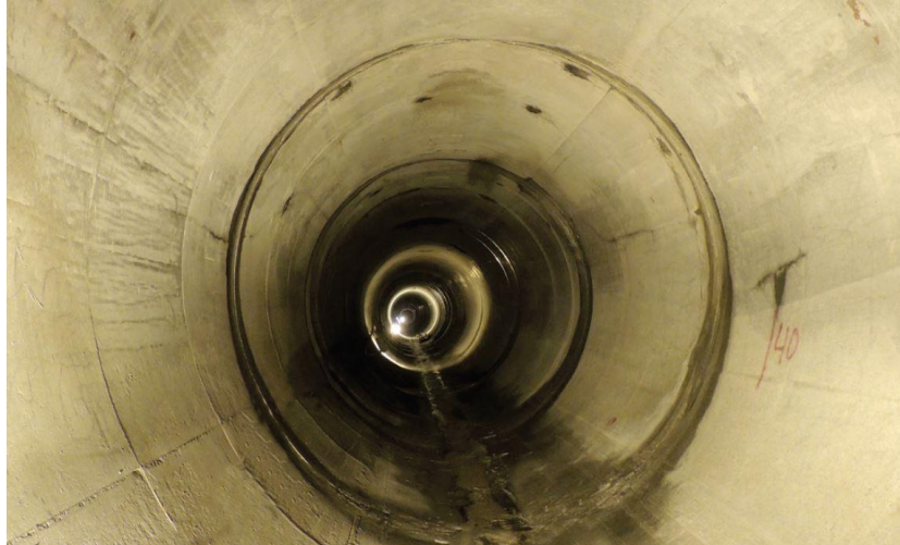
Head Race tunnel of 100 MW Sainj Hydroelectric Power Plant