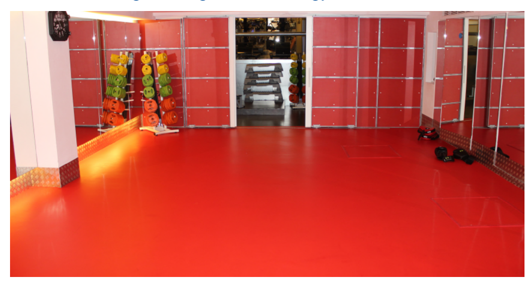
Our reference in London (United Kingdom): Third Space Health Club Marylebone

Sound reducing flooring solution for gym facilities